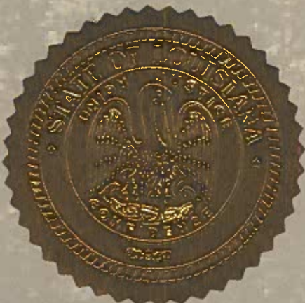
John Bel Edwards Governor

IN WITNESS WHEREOF, I have hereunto set my hand officially and caused to be affixed the Great Seal of the State of Louisiana, at the Capitol, in the City of Baton Rouge, on this 1st day of March A. D., 2023.