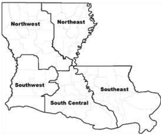
Figure 1. Statewide Flood Control Program Funding Districts for Rural Projects

D. Projects from sponsoring authorities seeking DOTD assistance in preparing applications will be scored and ranked with points awarded in the following manner.